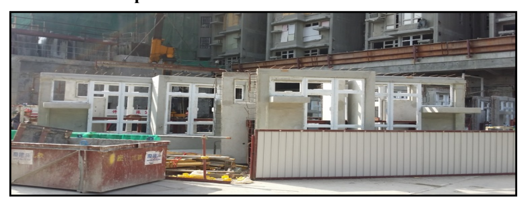
Figure 2: Company D site in Hong Kong for Precast construction

Students also worked on another BIM project (Company D) consisting of 7200 units across 9 blocks. All walls and ceilings were erected using pre-cast blocks with a batching plant on site. Figure 2 shows the photo of the precast construction components produced by Company D in Hong Kong. Students were excited about the use of modern construction methods and project management tools and provided positive feedback towards this internship program.