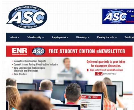
Figure 1. ASC/ENR Subscription Link on the ASC website www.ascweb.org