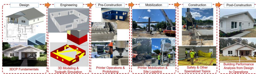
Figure 2. Project stages and educational needs in the case study project in Richmond, VA

To identify educational needs and opportunities in the application of 3D concrete printing in construction, this paper focuses on a case study project. Company 3D, an anonymized 3DCP company, and the Virginia Center for Housing Research (VCHR) at Virginia Tech performed a pilot partnership project, hereafter referred to as “the partnership”, for 3D printing affordable housing. The authors were directly involved in the project. The partnership built one 3D concrete-printed home prototype, known as “PACT,” in the greater Richmond, VA Metropolitan area. This section will discuss the project, 3DCP process in the project, and identified educational needs and opportunities. While PACT was a partnership of VCHR and a printing company, many more stakeholders were required to produce the affordable home. The larger production team consisted of Virginia’s housing finance agency, local non-profit builders and homeownership service providers, a general contractor, an architect and engineer of record, a real estate agent, local building and zoning officials, materials suppliers and the printer manufacturer. Together, this larger team designed the home, secured a permit, procured the land and the printer, developed the site, trained and 3D printed the walls, completed the home construction, systems and finishes, qualified an affordable homeowner and helped establish financing for the homeowner between 2020-2022.