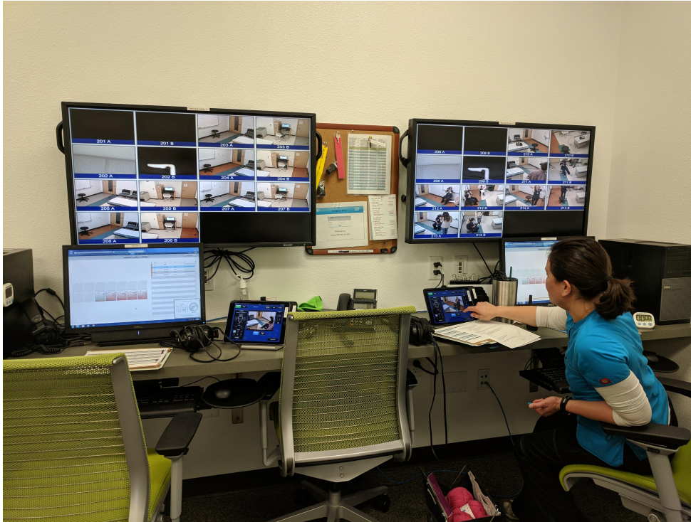
Figure 2: A picture of the standardized patient room control station.