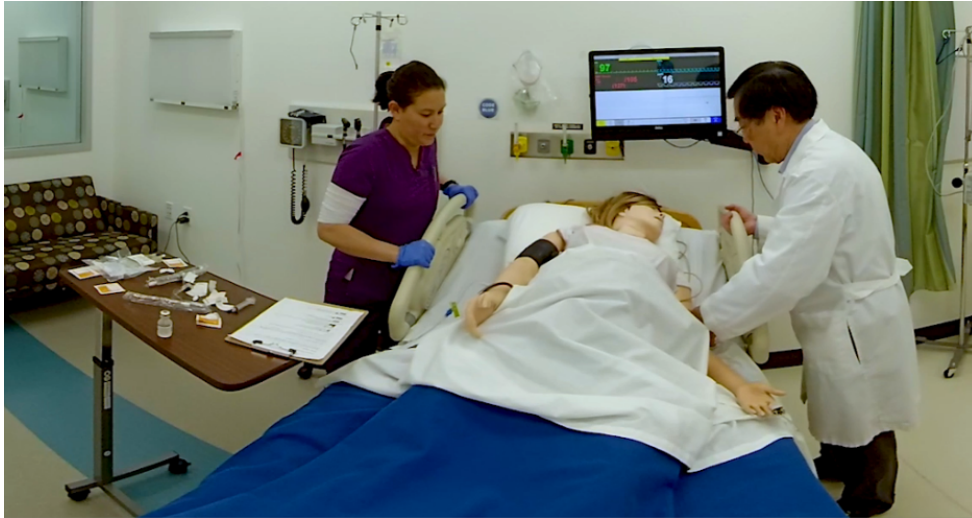
Figure 4: A screenshot of the 360°-video playing for each participant

AOIs were identified by the authors, and then we created invisible boxes that would move if the correlating AOI in the video moved. This means that when the nurse moved, so did her corresponding AOI.