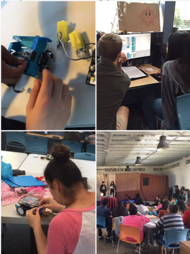
Image 2. Building, coding, costuming, and presenting