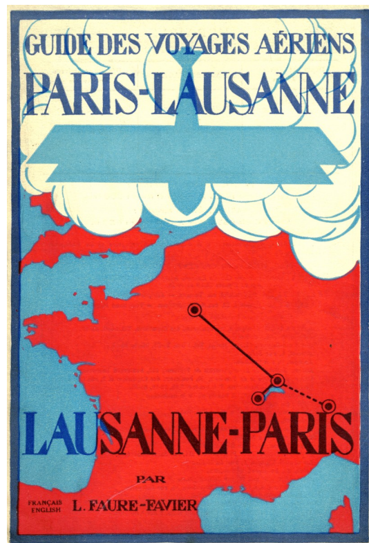
Fig. 3. Paris-Lausanne Air Travel Guide, 1922.

On 14 February 1922, the Lausanne Municipal Council granted a credit of CHF 250,000 for the transformation of the Blécherette airfield and for the construction of the Champ-de-l'Air radio station. A month later, in its session of 14 March 1922, the Lausanne municipality decided, "despite the inaccuracies of the French government with regard to the operating guarantees for the Paris-Lausanne air line", to place an order with the Société indépendante de télégraphie sans fil in Paris for the station to be installed at the Champ-de-l'Air [10].