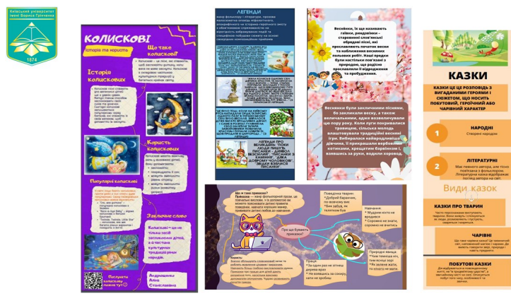
Fig. 2. Infographics created by students in the program Canva.

To create presentations, students use traditional methods Power Point from Microsoft. However, it should be noted that Google Presentations (81%) and partially Prezi (28%) are gaining more and more popularity among the respondents. In the student practice of preparing future primary school teachers for professional activities, comics are gaining relevance. Students use e-resources to create comics (Comic Master (32%), Pixton (42%), Storyboardthat (46%)). During the classes on professional methods, students are offered to create comics in order to present any topic in the form of an interesting story in pictures. Students learn to use comics in a variety of subjects. Thanks to them, you can visualize: basic concepts, rules; show the course of experiments and experiments, depicting their algorithm on several frames; the plot of the work of art. Moreover, it is possible to create scenes with the participation of the main characters in order to observe their characters and actions; dialogues between students and outstanding scientists, writers, travelers, artists; life situations of communication; speech constructions, etc.