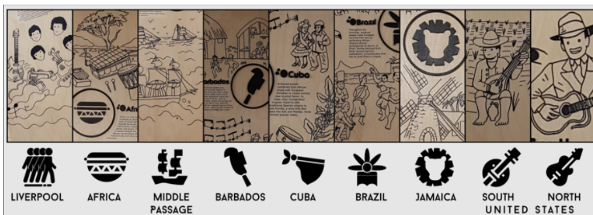
Figure 3. Afrobits Interaction Points

Congress (USA), as well as some recent sound samples from artists such as Bob Marley and the Beatles. Figure 3 shows all these interactive points and some of their visual elements, which were also rendered from historic archives.