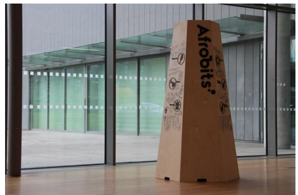
Figure 1. Afrobits Installation

Afrobits is an interactive installation that enables audiences to explore a new narrative of the Trans-Atlantic Slave Trade. It presents the tangible and intangible contribution through sound, music, instruments and stories of people enslaved during the Trans-Atlantic Slave Trade. The installation is a wooden cone structure with attached conductive sensors that are connected to a micro-controller, linked to a sound system. The conductive sensors detect the proximity of the user and triggers a specific sound file through the micro-controller. Afrobits includes 9 points of interaction: Liverpool, Africa, the Middle Passage, Barbados, Cuba, Brazil, Jamaica, and the North and South of the United States of America. Each point of interaction contains a small piece of original research reflecting on the place, its music and African influence, as well as a representative soundtrack, iconography and illustrations of local life (see Figure 1). Afrobits thus allows users to engage with Intangible Cultural Heritage through physical interaction with a tangible interface.