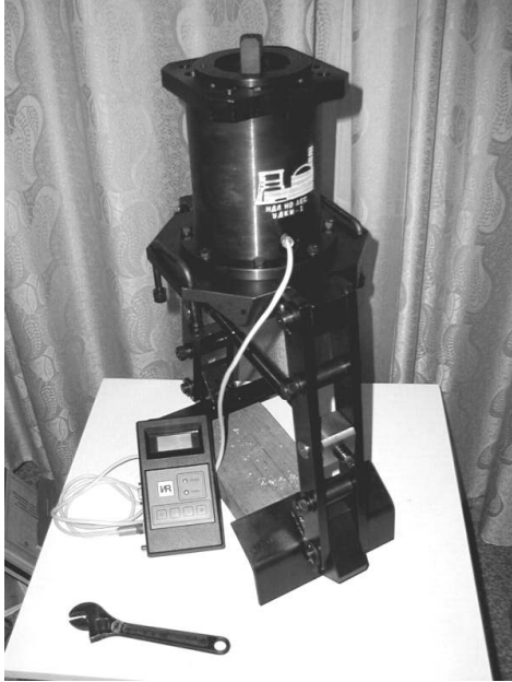
Fig. 1. TDD – general view.

In Fig. 1 observed is a square slot through which the torque is transmitted directly from the electric drive to the torque sensor. The sensor signal enters the secondary reader and is displayed on the LCD screen. The TDD is mounted on special supports allowing it to be installed on a pipeline next to the tested fittings. If necessary, the supports are removed and you can mount the TDD on the valve flange or on a special stand.