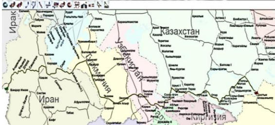
Figure 4. Scheme of the route port of Bandar-Imam – Dostyk st., through the border crossing of Ince-Borun-Akayla (exp.)

Imagine a route through the border crossing of Inche-Borun-Akayla (exp.), Figure 4.