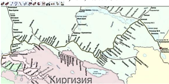
Figure 10. Scheme of the route Sary-Agach st. - Dostyk st. (Kazakhstan)