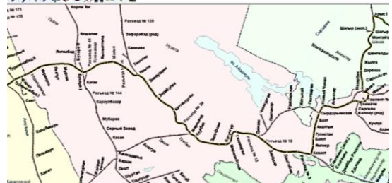
Figure 8. Scheme of the route Khojadawlet st. - Keles st. (Uzbekistan)