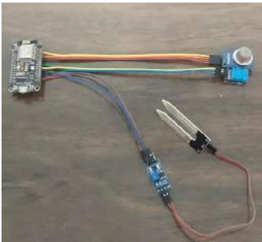
Fig. 2. Hardware Module