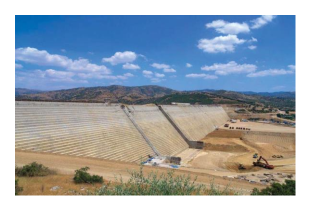
Fig. 8. Downstream face of Beydag dam