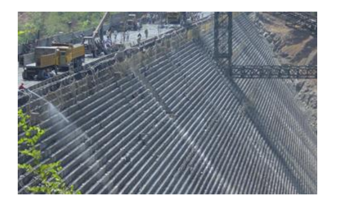
Fig. 7. Ghatghar Village, Maharashtra, India