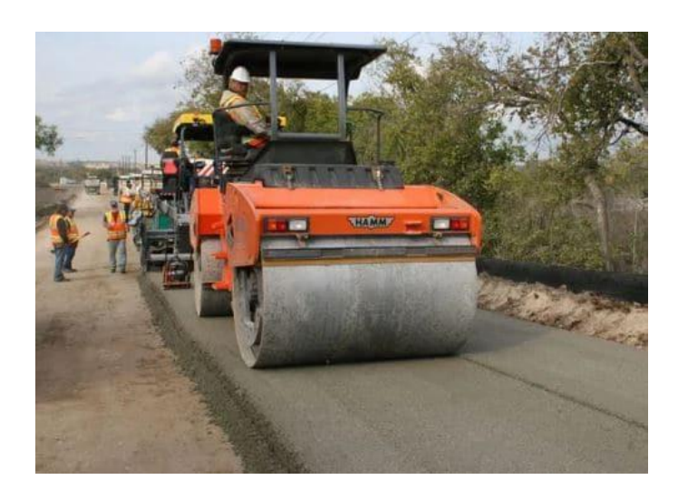
Fig. 6. Roller Compacted Concrete for Road Construction