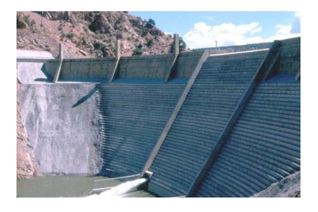
Argentina popularly known as Puerto Santa Roller Compacted Concrete Cruz Dam