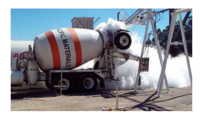
Fig. 4. Liquid nitrogen cooling is sometimes used to reduce the temperature of the concrete prior to the time of placement

the concrete mix by any amount (to as low as 35°F). LN2 cooling requires highly specialized equipment to safely cool concrete and can be expensive.