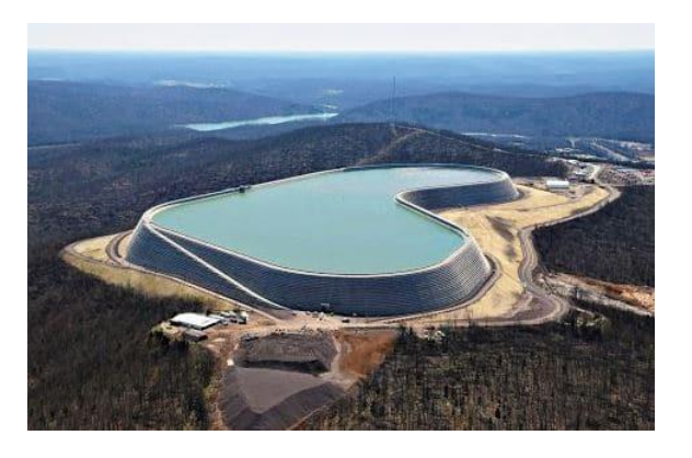
Fig. 9. RCC dam of Santa Cruz River in Fig. 10. Taum Sauk Dam Constructed Using