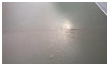
Fig. 4. Difference between two different polyurethane-cement floorings laid on the same floor