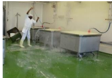
Fig. 6. Thermal and chemical burdens acting on floor in technological cycle

As many as 1 000 kegs are cleaned and filled per hour. It is not a rare occurrence that a filled keg weighing 72 kg falls down from the production line and hits the floor. The latter is constantly exposed to the action of detergents and disinfectants up to 80°C hot, whose acidity and alkalinity range from 1 pH (a strongly acid environment) to 13.8 pH (a strongly alkaline environment).