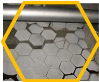
Fig. 3. Loose and shifted tiles in dairy floor