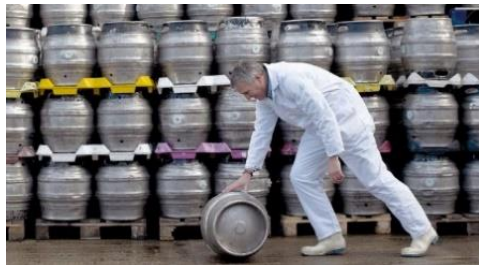
Fig. 5. Transport of kegs of beer on hot floor

In many industries high temperatures originating from both production and clean up processes (e.g. cleaning tiles with steam) act on the floor. The action of high temperatures can momentarily weaken the resistance of the floor to mechanical loads, which often occur simultaneously. An example here can be the bottling plant areas in which the inside and outside surfaces of kegs are cleaned and sterilized and subsequently the kegs are filled with beer, labelled and rolled on the floor (see Fig. 5).