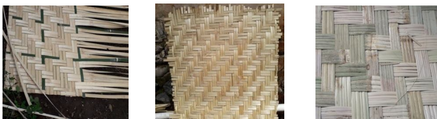
Figure 2. Variety of Gedhek Piphil Motifs

The outer walls of Using ’s house generally use gedhek with piphil motifs without windows [8]. Gedhek piphil motif in Figure 2 shows the geometric shape, especially a rectangle. In addition, the geometric patterns on gedhek also show the congruence of shapes and transformations of rectangular shapes. Rectangles, congruence, and transformations are mathematical concepts that can be found in gedhek woven patterns. The existence of mathematical concepts in gedhek is a form of ethnomathematics.