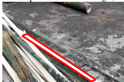
Figure 12. Split Bamboo

Meanwhile, the split bamboo shows a shape similar to a rectangle, as shown in Figure 12.