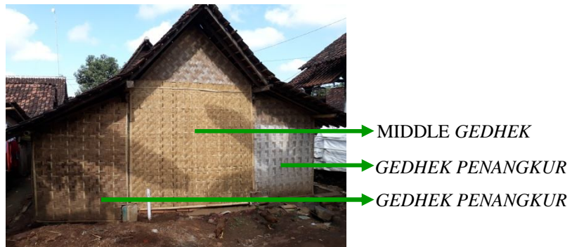
Figure 5. Using's House Walls

Figure 5 shows that the gedhek at the side of the house consists of two parts, namely gedhek penangkur and middle gedhek . Gedhek penangkur is usually made with a size of 2.5 \times 3 meters, while the middle gedhek is usually made up to 3,5 meters long. Gedhek penangkur is generally cut in the form of rectangular trapezoid. The middle gedhek is combination of a rectangular shape and a triangle shape.