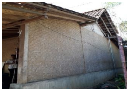
Figure 1. “Bamboo Plaster” Model in Using ’s House

The outer walls of Using ’s house generally use gedhek with piphil motifs without windows [8]. Gedhek piphil motif in Figure 2 shows the geometric shape, especially a rectangle. In addition, the geometric patterns on gedhek also show the congruence of shapes and transformations of rectangular shapes. Rectangles, congruence, and transformations are mathematical concepts that can be found in gedhek woven patterns. The existence of mathematical concepts in gedhek is a form of ethnomathematics.