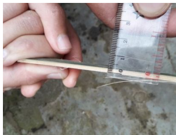
Figure 9. Thickness of The Iratan

In general, the cut used for gedhek has a thickness of about 0.2 cm as shown in Figure 9. If more than that, the weaving process will be difficult to do.