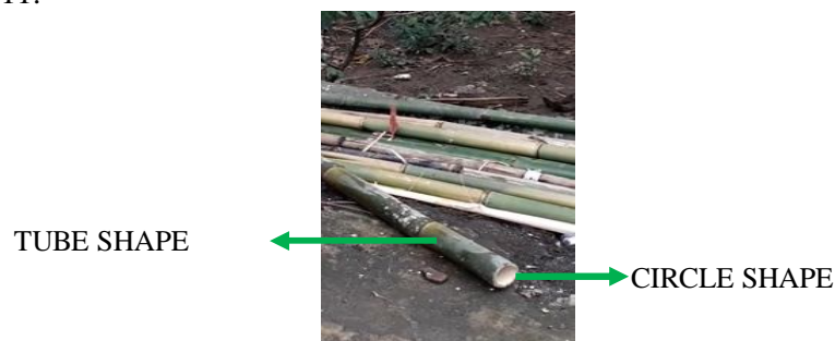
Figure 11. Bamboo Forms Before Splitting

Before being split, bamboo can be shown as a shape resembling a tube with a circular surface, as shown in Figure 11.