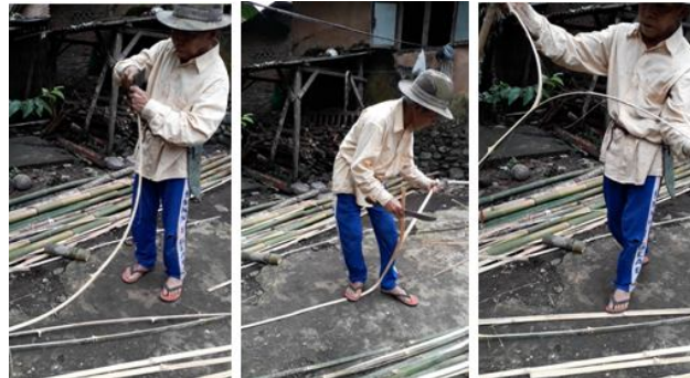
Figure 8. Ngirat Process

In general, the cut used for gedhek has a thickness of about 0.2 cm as shown in Figure 9. If more than that, the weaving process will be difficult to do.