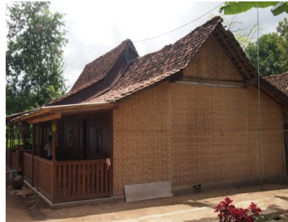
Figure 3. The Using's House at The Kemiren Village

The Using's house is a traditional house of the Banyuwangi tribe which is still made of available materials, such as wood and bamboo. The Using's house in Figure 3, uses wood as the frame of the house, woven bamboo as the side wall and partitions of the house, wood at the front of the house called gebyok , tiles made of clay, and floors made of soil or cement.