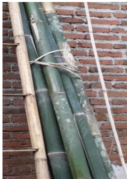
Figure 4. Benel Bamboo as a Woven Material

The walls of Using's house are made of woven bamboo, called gedhek . The type of bamboo that is usually used is Benel bamboo, as shown in Figure 4. Benel bamboo has sections with an average length of 40 to 50 cm. Bamboo is cut 2 to 2.5 meters long or contains about 4 to 5 sections. The bamboo cutting is adjusted to the gedhek to be made.