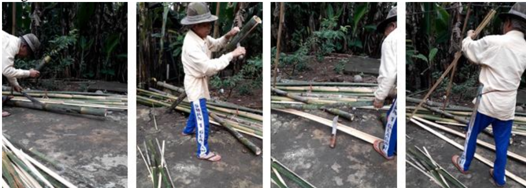
Figure 6. Bamboo Splitting Process

The process of making gedhek starts from cutting the bamboo (as shown in the series of Figure 6) with a length of 2 to 2.5 meters. The selected bamboo has a diameter of between 6 and 7 cm.