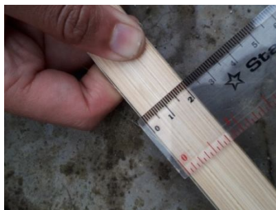
Figure 7. The Width of The Bamboo Slit

Each piece of bamboo is divided into 10 sheets which have a width of about 2 cm, as shown in Figure 7. In this splitting process, the protrusions of bamboo joints are cleaned and flattened to make them tidier for use in plaiting.