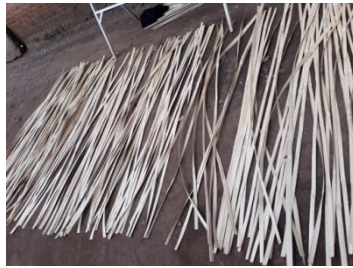
Figure 13. Iratan Bamboo in The Drying Process

After the drying process, iratan will shrink in thickness. However, the shrinkage is so small that it is difficult to measure.