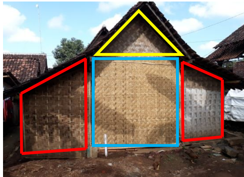
Figure 15. Geometric Shapes on The Walls of Using's House

To get the shapes referred to as in Figure 15, it is necessary to measure the standard unit, namely meters, in order to obtain a match between gedhek and the frame of the house. This measurement causes the installer to estimate the demand for gedhek to be used and the costs required according to the unit price of the gedhek .