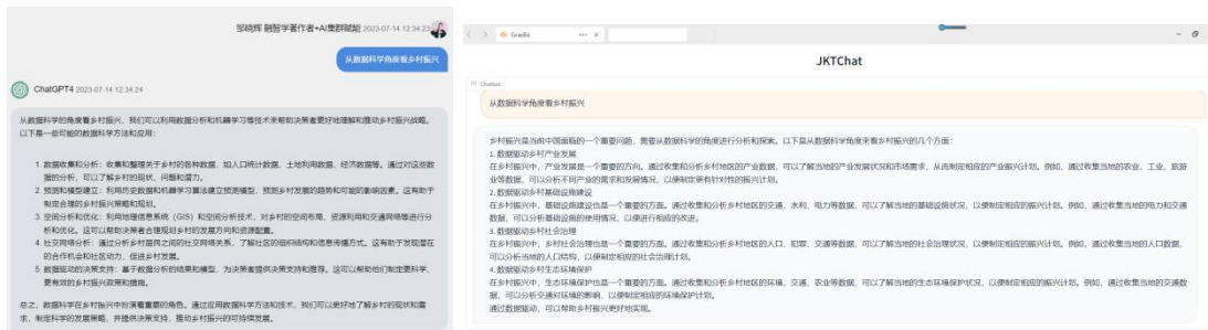
Fig. 1. (a) first picture is Zou with ChatGPT4 by Time-saving technology; (b) second picture is Zou with Chatbot by JKTChat.