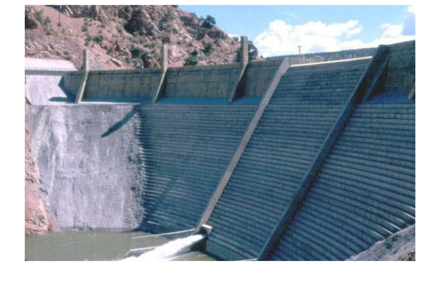
Argentina popularly known as Puerto Santa Roller Compacted Concrete Cruz Dam