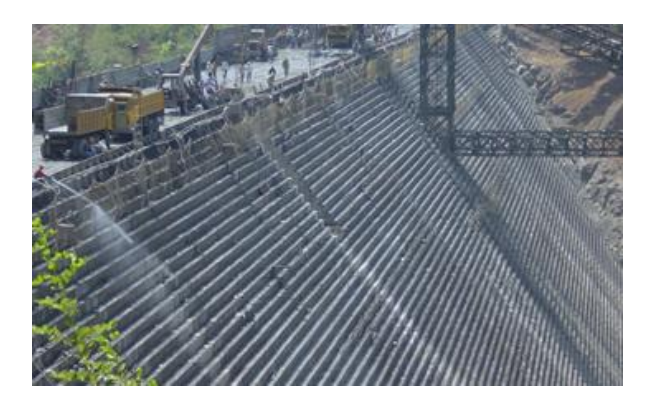
Fig. 7. Ghatghar Village, Maharashtra, India