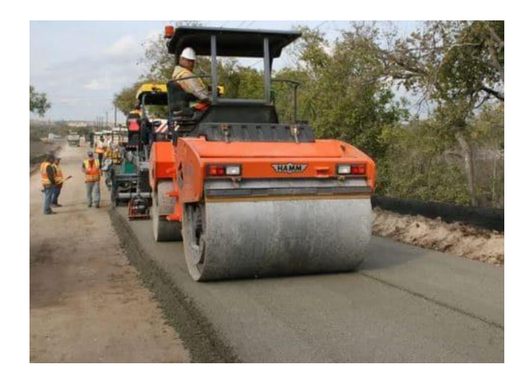
Fig. 6. Roller Compacted Concrete for Road Construction