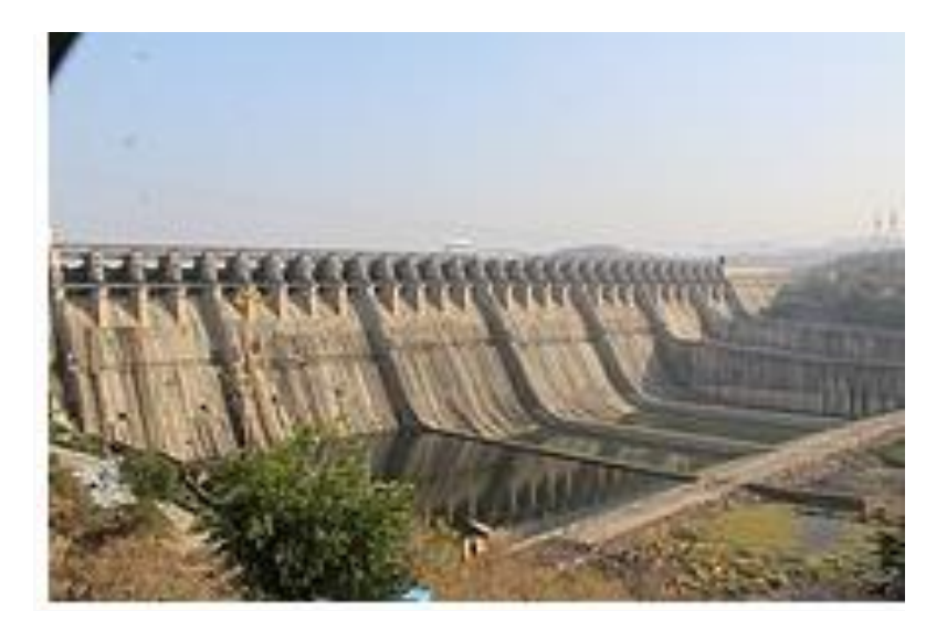
Fig. 1. Mass concrete structure of Sardar Sarovar Dam on Narmada River

Definition: Mass concrete is defined as "any volume of concrete with dimensions large enough to require that measures be taken to cope with the generation of heat from hydration of cement and attendant volume change to minimize cracking" (ACI 207). The one characteristic that distinguishes mass concrete from other concrete work is thermal behavior.