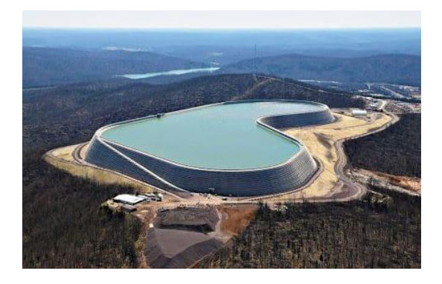
Fig. 9. RCC dam of Santa Cruz River in Fig. 10. Taum Sauk Dam Constructed Using