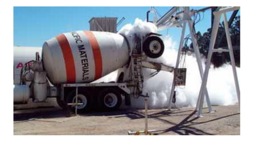
Fig. 4. Liquid nitrogen cooling is sometimes used to reduce the temperature of the concrete prior to the time of placement

the concrete mix by any amount (to as low as 35°F). LN2 cooling requires highly specialized equipment to safely cool concrete and can be expensive.