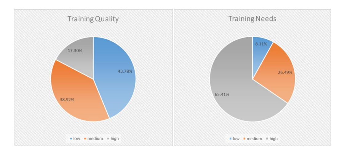
Figure 2. Training quality level (1-6): low ( \leq 3), medium (3,4), and high ( \geq 4 )/ Training needs level (0-4): low ( \leq 2), medium (2,3), and high ( \geq 3).

** p< 0.01 level (2-tailed), * p< 0.05 level (2-tailed).