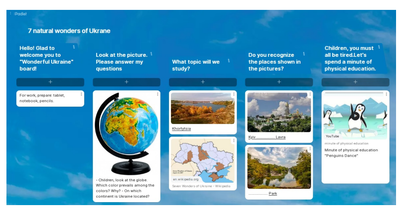
Fig. 3. An example of using a virtual interactive whiteboard in a primary school.

Answering about using platforms to create virtual whiteboards, students preferred Padlet (48%) due to its wide range of features. Students of higher pedagogical education are aware that it is appropriate to use a virtual interactive whiteboard during distance learning. This network resource as a learning tool is used to coordinate group work with various content with the possibility of joint editing, communication in the lesson in real time. Thanks to the interactive online board, it is possible to combine text, images, video, audio in an interactive format. Students noted the advantages of the Padlet interactive board in the work of a primary school teacher. This is convenient for the location of educational information, which the teacher can prepare in advance according to the topic of the lesson. Thanks to this property of the virtual board, future teachers can organize the educational process using interactive methods. When students solve educational tasks, it is enough to activate the corresponding block and the algorithm of actions will appear on the Padlet wall. Also, it is convenient to place completed tasks of students on the virtual board for joint discussion (see Fig. 3).