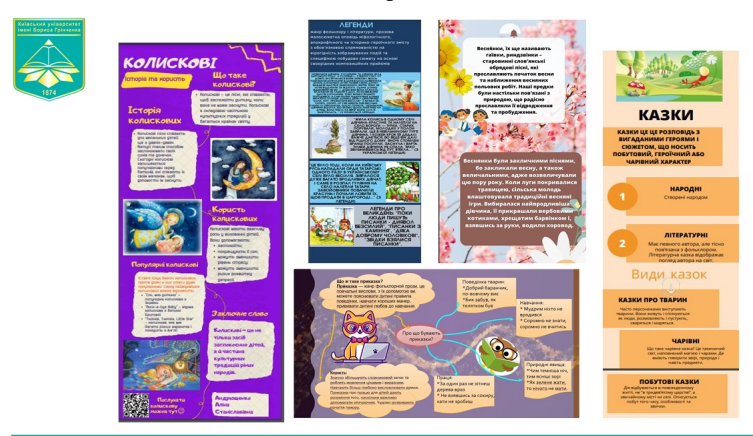
Fig. 2. Infographics created by students in the program Canva.

To create presentations, students use traditional methods Power Point from Microsoft. However, it should be noted that Google Presentations (81%) and partially Prezi (28%) are gaining more and more popularity among the respondents. In the student practice of preparing future primary school teachers for professional activities, comics are gaining relevance. Students use e-resources to create comics (Comic Master (32%), Pixton (42%), Storyboardthat (46%)). During the classes on professional methods, students are offered to create comics in order to present any topic in the form of an interesting story in pictures. Students learn to use comics in a variety of subjects. Thanks to them, you can visualize: basic concepts, rules; show the course of experiments and experiments, depicting their algorithm on several frames; the plot of the work of art. Moreover, it is possible to create scenes with the participation of the main characters in order to observe their characters and actions; dialogues between students and outstanding scientists, writers, travelers, artists; life situations of communication; speech constructions, etc.