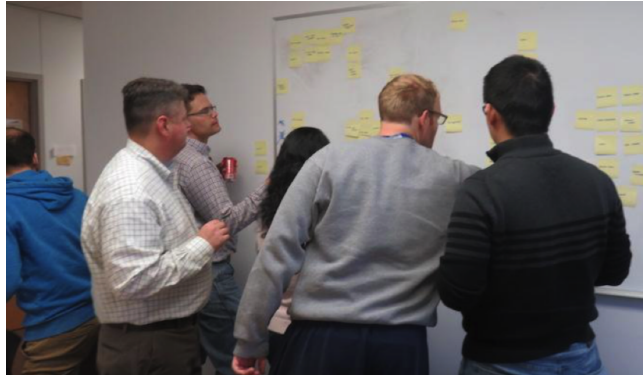
Figure 3: Participants during the second affinity-diagramming session

The axis placement exercise aided in determining/making connections between clusters, the distance between clusters having some meaning that was not apparent from the clustering exercise.