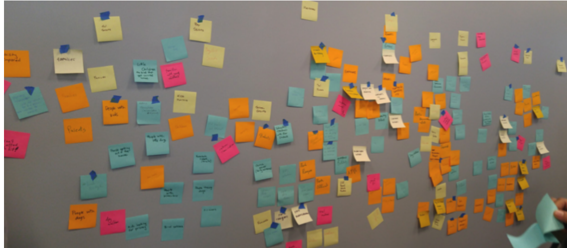
Figure 1: A picture of the original affinity-diagramming session in progress

types of trail users such as hunters (e.g., bow hunters, rifle hunters, and deer hunters and duck hunters) [2], as well as among different types of technology users and uses (e.g., use of Fitbits, and of headphones) [1], and of naturalists (e.g., those who study plant propagation and those who eradicate invasive species).