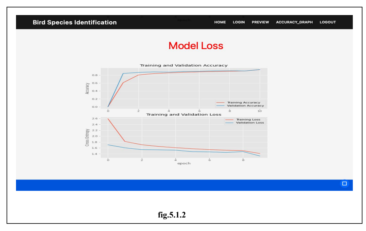
fig.5.1.2 shows the terms of cross entropy, which is a commonly used loss function in classification tasks, the training loss decreases from an initial value of 2.6 to 1.6. Similarly, the validation loss decreases from 1.7 to 1.3. These decreasing loss values indicate that the model is becoming more accurate in its predictions and reducing its prediction errors.