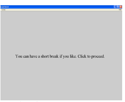
Figure 3: Inter-Experiment Interval