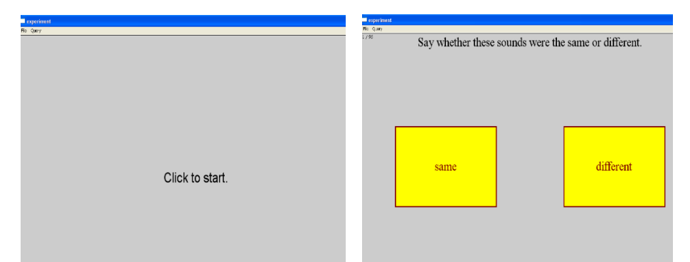
Figure 1: Pre-Start Step of the Experiment. Figure 2: The Start Step of the Experiment

on either the same or different buttons as they heard the stimuli. The stimuli were presented in four blocks of 24 trials each. The subjects could take a short break between blocks; thus, there were three short breaks for the whole experiment. This phase took about 15 minutes for each subject (Figures 1, 2,3).