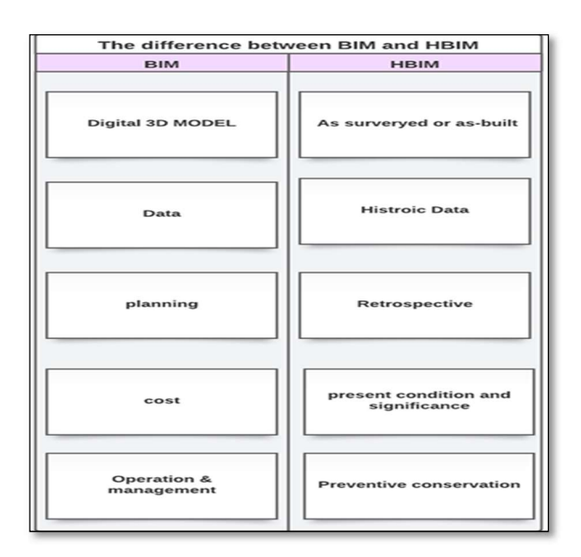
Figure 1. In compared to traditional BIM data models, the figure illustrates the kind of information that should be incorporated in HBIM data models.(Yang et al. 2020)

In the continuum of digital modelling, BIM and its historical counterpart, HBIM, distinctly diverge across several critical dimensions. BIM predominantly caters to contemporary construction projects, facilitating collaborative virtual models for new developments. In contrast, HBIM serves as a specialized tool for the preservation and maintenance of historical structures, encapsulating their intrinsic attributes and cultural significance. While BIM captures comprehensive building data spanning design and construction phases, HBIM emphasizes information specific to historical edifices. Both aim for precise digital representations, with HBIM placing a heightened emphasis on geometric accuracy to preserve the unique architectural intricacies of historical constructions. Crucially, HBIM acts as a facilitator for conservation endeavours, offering a collaborative platform for stakeholders and seamlessly integrating conservation tasks within the model (Figure 1).